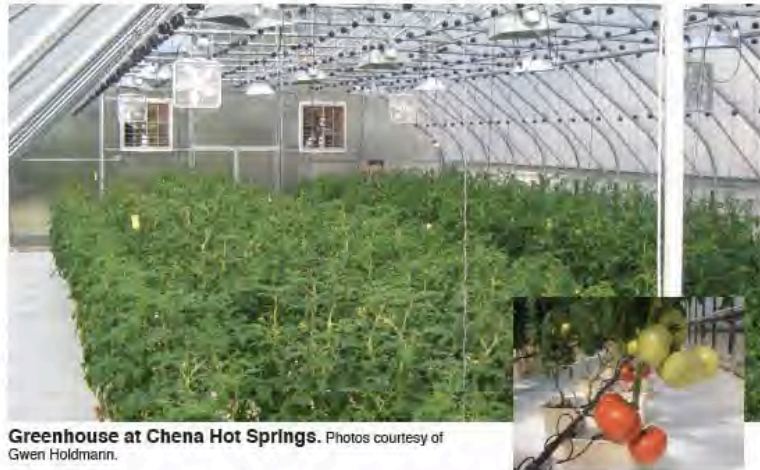
Greenhouse at Chena Hot Springs.

For more information, please see: www.chenafresh.com