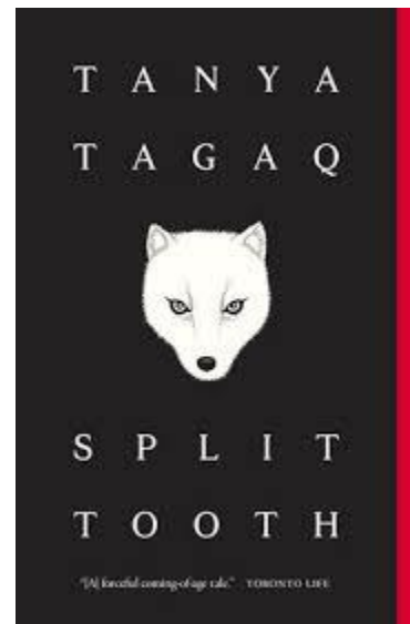
Split Tooth by Tanya Tagaq (2018)